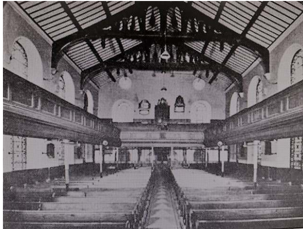
Fig 2. View from sanctuary towards western gallery (c1900) showing roof trusses (upper west gallery now removed)

14. Further, alterations were made to the staircases to the gallery and to the chancel in the late 19 th century, following the installation of the East End window designed by Henry Holiday.