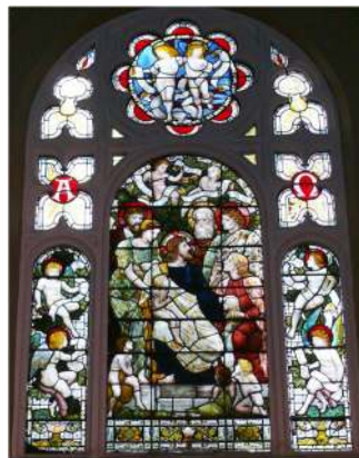
Fig 3. Henry Holiday sanctuary window

14. Further, alterations were made to the staircases to the gallery and to the chancel in the late 19 th century, following the installation of the East End window designed by Henry Holiday.