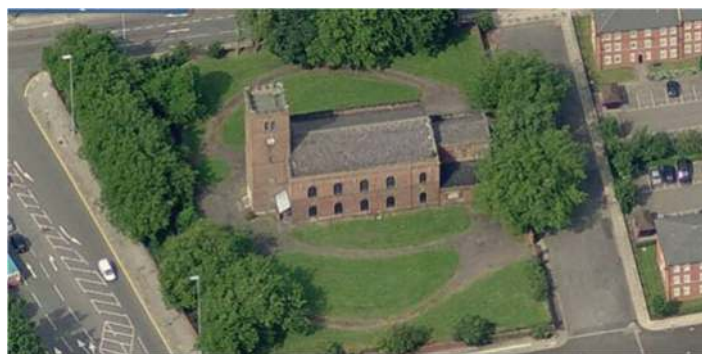
Fig 1 Aerial view of St James 2010 (C19th chancel extension on right )

1. The church of St James in the City, Toxteth, Liverpool, is a Grade II* listed building, constructed in the Georgian period in 1774. It sits under the shadow of the famous Anglican cathedral in Upper Parliament Street positioned on the hill at the edge of the city centre, but with an outlook over the River Mersey, and has been a prominent landmark for over two and a half centuries. Although a thriving centre of worship for a diverse community of churchgoers for much of this time, sadly in the early 1970s dwindling congregations, neglect and poverty in the area together with a lack of any local regeneration led to the closure of the church in 1974 as it was declared redundant, with it vesting in the redundant churches' fund two years later. St James then became the responsibility of the Churches Conservation Trust, (CCT) but further decline, including fabric decay and vandalism over the following decades diminished the church's prospect of any meaningful restoration, despite its listed status, and it remained a sad and empty shell.