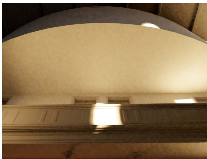
Fig 6. Concept image showing projection of upper tier beyond existing balcony

24. Because I was unsure as to the degree of overhang relative to the extra space, which I am told was necessary to accommodate additional space within the upper room and which will make a significant difference to the number who can meet there, I asked the architect, Mr Thorpe, to provide some elaboration. He forwarded the following image. 3