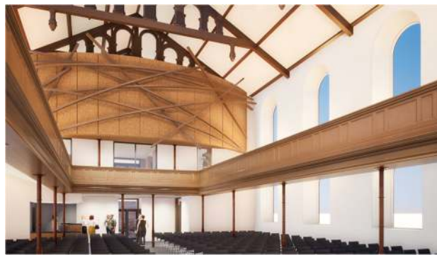
Fig 5. New internal layout showing floating balcony from the nave

22. I have summarised the scheme at paragraph 5 above. The full specification is not included within the OFS papers, and I do not believe that it is necessary to consider this, as much of it will be functional, and associated with repair and restoration of existing fabric. The major changes represented by the balcony alteration are those which are the most controversial, and they are depicted in a number of photographs and plans. Essentially the open nature of the western gallery in front of the tower will be lost and replaced with the structure of an internal two-storey "hub" or "pod", the upper and carved section of which will overhang the gallery frontage, which is to be retained. This is best depicted in the following image from the concept visuals: